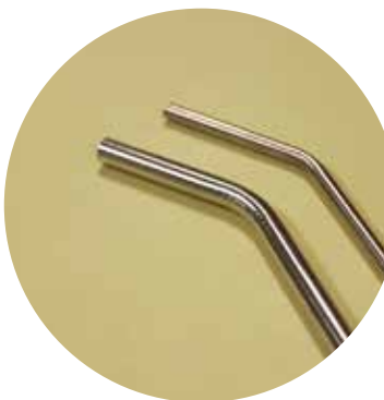
STEELYS DRINKWARE Stainless Steel SteelysDrinkware.com