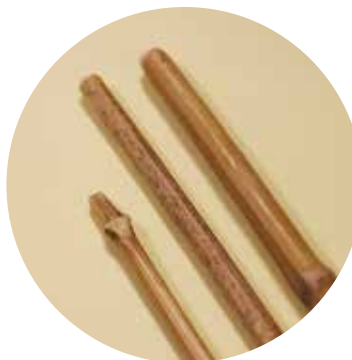
STRAW FREE Bamboo Strawfree.org