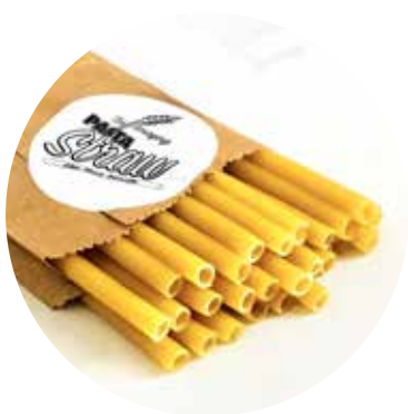
THE AMAZING PASTA STRAW BY THE AMAZING PASTA STRAW COMPANY Wheat, water https://www.pastastraws.org/