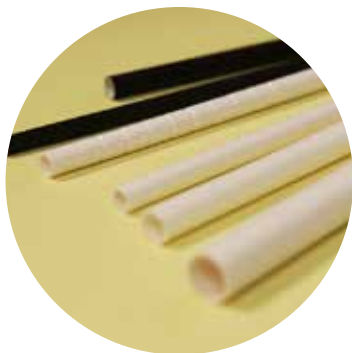
AARDVARK Paper straws Aardvarkstraws.com

These resources were gathered primarily from For A Strawless Ocean . Visit StrawlessOcean.org/Alternatives for discount codes.