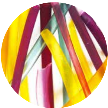
LOLISTRAW BY LOLIWARE Seaweed Kickstarter.com/projects/1530128773/lolistraw-by-loliware