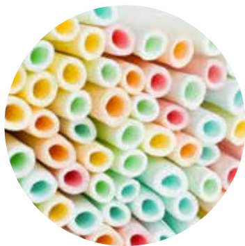
SORBOS Sugar WeareSorbos.com